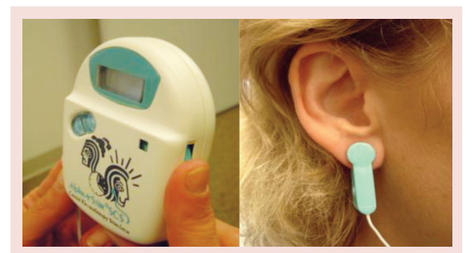
Note. Ear clips are worn on both ears.

The institutional review boards of the University of Virginia and Virginia Commonwealth University approved