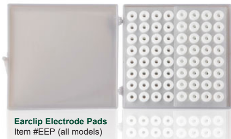
Earclip Electrode Pads Item #EEP (all models)

If the connection between the lead wire and electrode becomes loose, you may lightly squeeze the outlet where the lead wire plugs into the electrode.