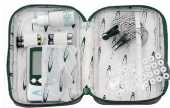
AID Soft Case Item #505 (AID model only)