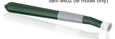
Smart Treatment Probe Item #402 (M model only)