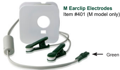
M Earclip Electrodes Item #401 (M model only)

Tip! Remove old felt pads after you complete a CES treatment. If there is glue residue you may clean the metal surfaces of earclips with alcohol. When the surfaces are dry, place a new felt pad on each surface. The manufacturer indicates felts are intended for single use. Some clients with their own Alpha-Stim® use the felts several times before replacing them.