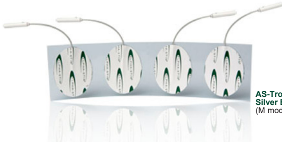
AS-Trodes™ Self-Adhesive Silver Electrodes Item #AT7 (M model only)

Tip! You can extend the life of your AS-Trodes™ by following these simple rules: