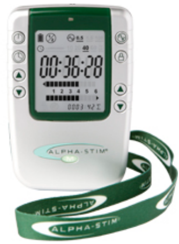
Alpha-Stim® M Item #400KIT