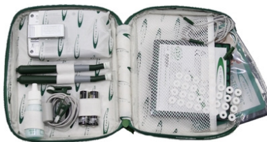
M Soft Case Item #407 (M model only)