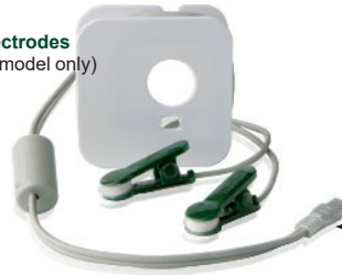
AID Earclip Electrodes Item #501 (AID model only)

Tip! Your Alpha-Stim is powered by batteries which will need replacement. There is a battery indicator on the display that monitors the battery level. Please use lithium batteries only.