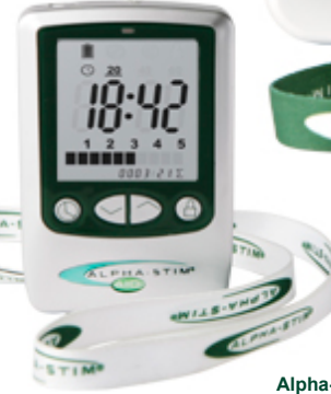
Alpha-Stim® AID Item #500KIT