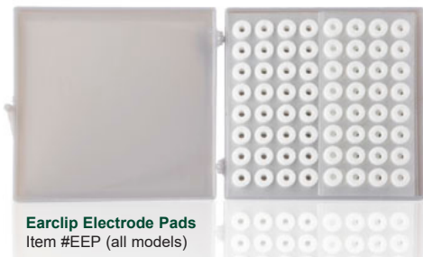
Earclip Electrode Pads Item #EEP (all models)

If the connection between the lead wire and electrode becomes loose, you may lightly squeeze the outlet where the lead wire plugs into the electrode.