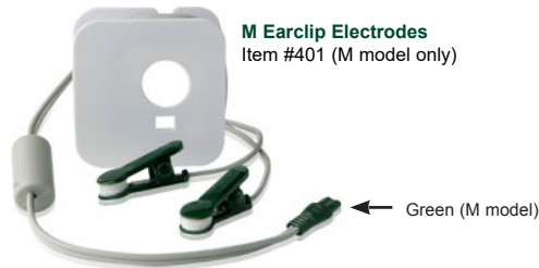
M Earclip Electrodes Item #401 (M model only)

If the connection between the lead wire and electrode becomes loose, you may lightly squeeze the outlet where the lead wire plugs into the electrode.