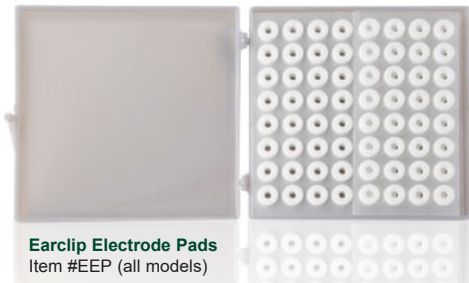
Earclip Electrode Pads Item #EEP (all models)

Tip! Remove old felt pads after you complete a CES treatment. If there is glue residue you may clean the metal surfaces of earclips with alcohol. When the surfaces are dry, place a new felt pad on each surface. The manufacturer indicates felts are intended for single use. Some clients with their own Alpha-Stim® use the felts several times before replacing them.